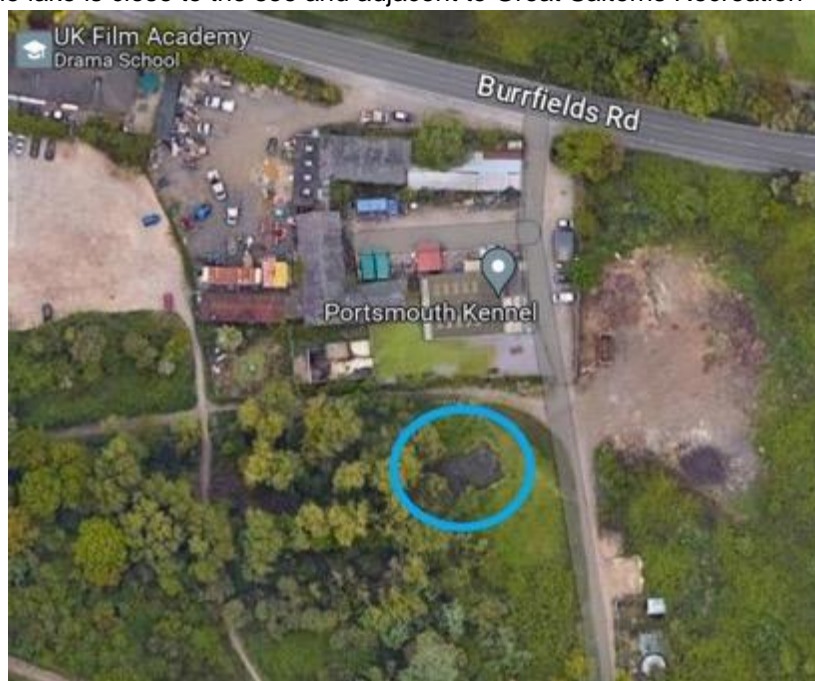
Map of Great Salterns Lake

Great Salterns Lake is approximately 400m in length by 200m in width on the Eastern side of Portsmouth. The lake is close to the sea and adjacent to Great Salterns Recreation Ground.