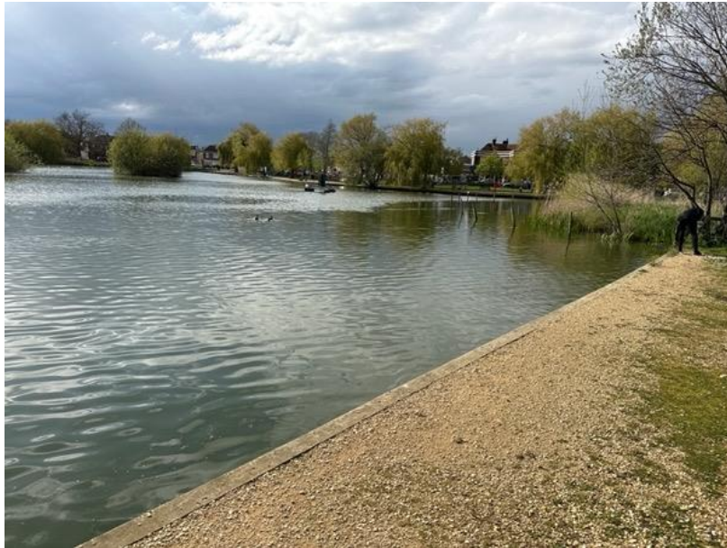
Photograph 1. Clear : Edge Protection

Consider removing the PRE life rings because it is shallow. Continually monitor for changes to the environment with at least quarterly visits.