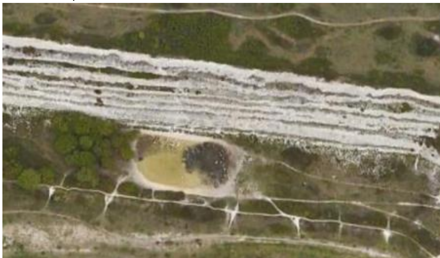
Map of Paulsgrove Chalkpit

This is a hidden shallow pond at base of the chalk cliff to the north and off Portsea Island.