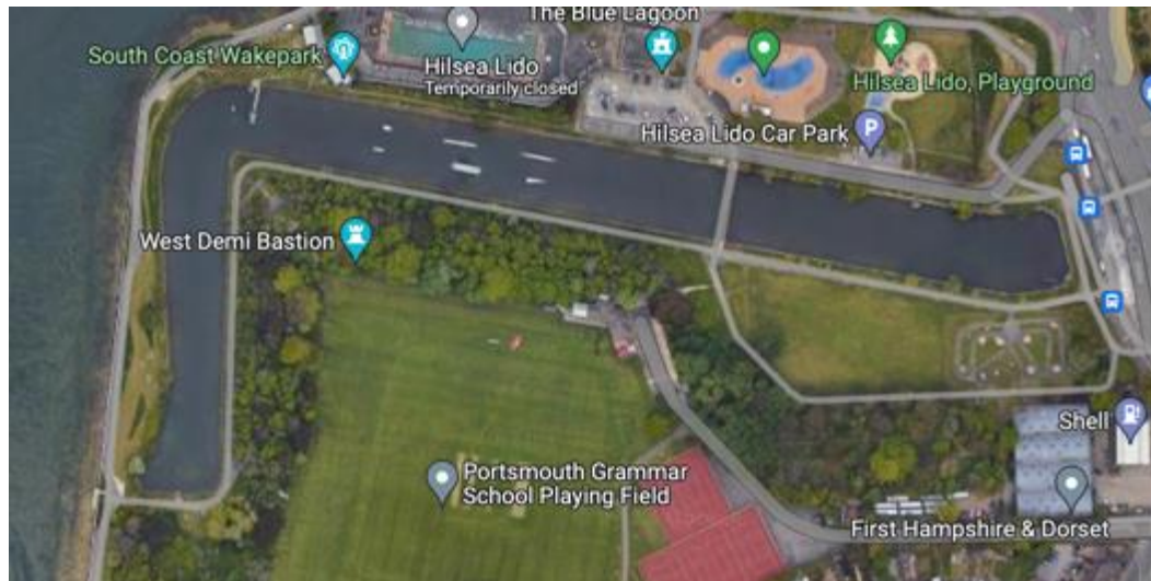
Map of Hilsea Water Sports Lake

The lake is at the north edge of the city - west side of northern edge of island.