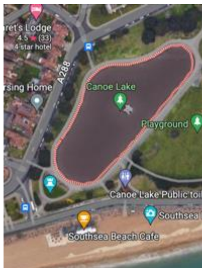
Map of Canoe Lake

Canoe Lake is in Southsea and very close to Southsea Beach.