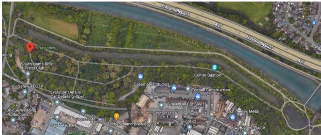
Map of Hilsea Lines

Series of 3 long narrow lakes within wooded green space bordering Portsbridge Creek.