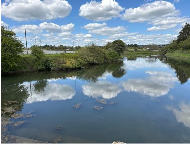
Photograph 2 : Lake Banks