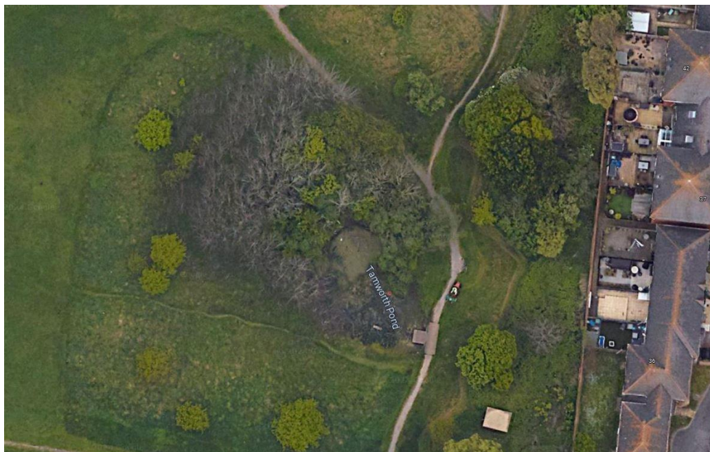
Map of Tamworth Pond

This is a shallow pond with decking platform at the east end of Tamworth Park on the east side of the island of Portsea island