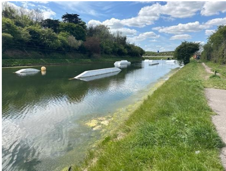
Photograph 1 : Wakeboard Park

Place one PRE at the bridge and one at the seating positions which covers access points and congregation point.