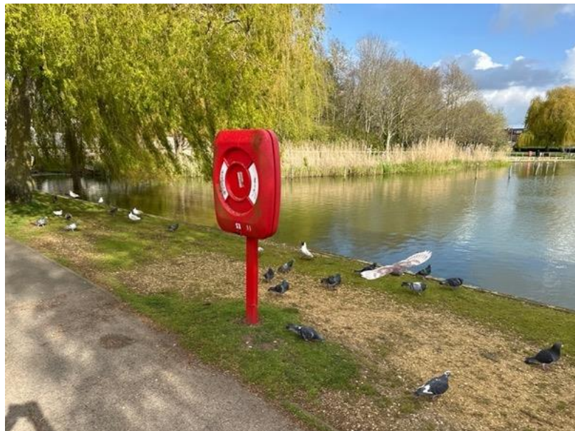
Photograph 2 : Liferings around the Pond