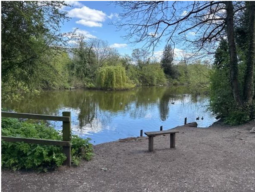
Photograph 1 : Clearly Defined Access to Water

Create working group and consider removing PRE due to location, vandalism and no history of water activity. Continually monitor through the year with quarterly audits.