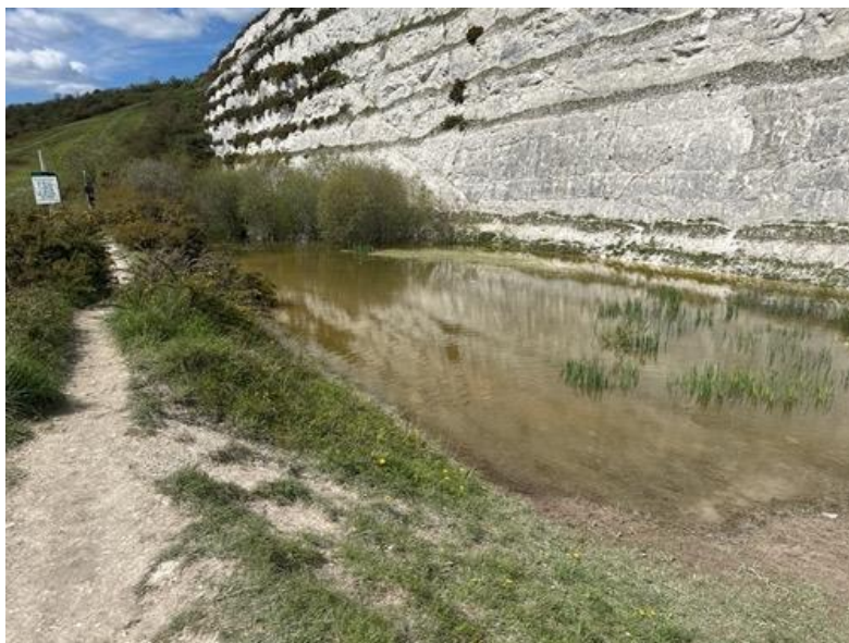
Photograph 1: Clear water edge

No changes. Continually monitor for changes to the environment with at least quarterly visits.