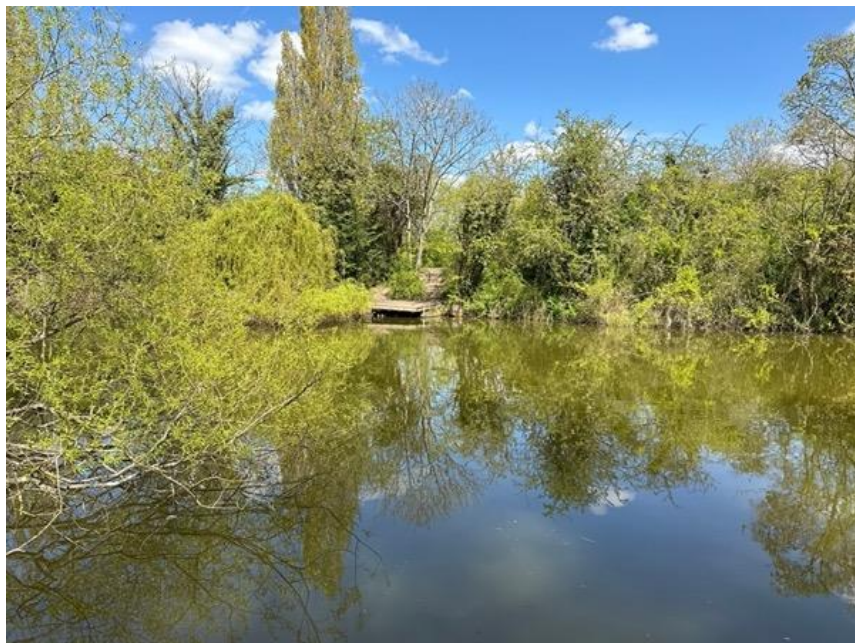
Photograph 2 : Natural Edge Protection and Fishing Peg