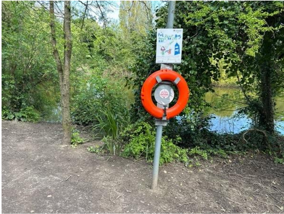
Photograph 3 : Life Ring