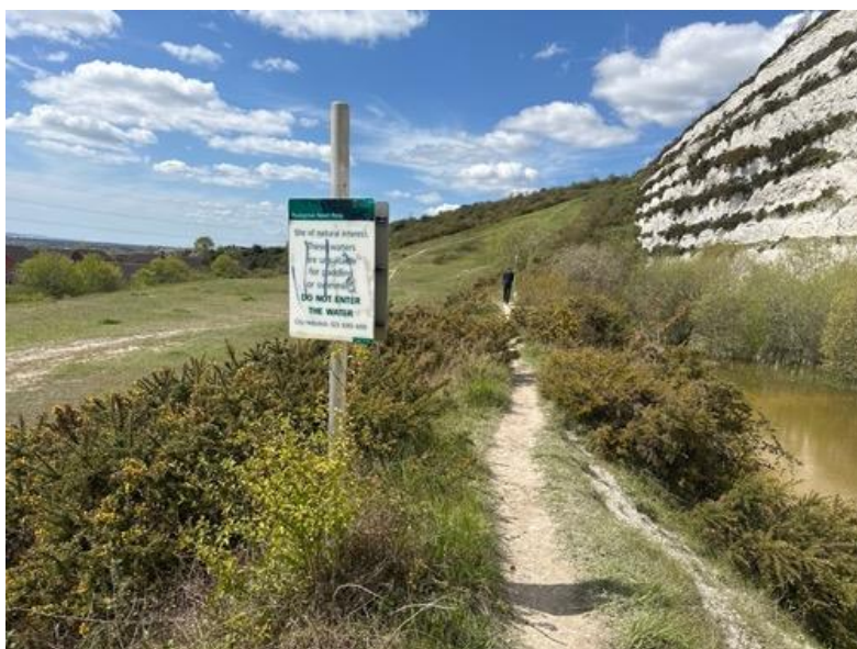
Photograph 2: Water Safety Sign