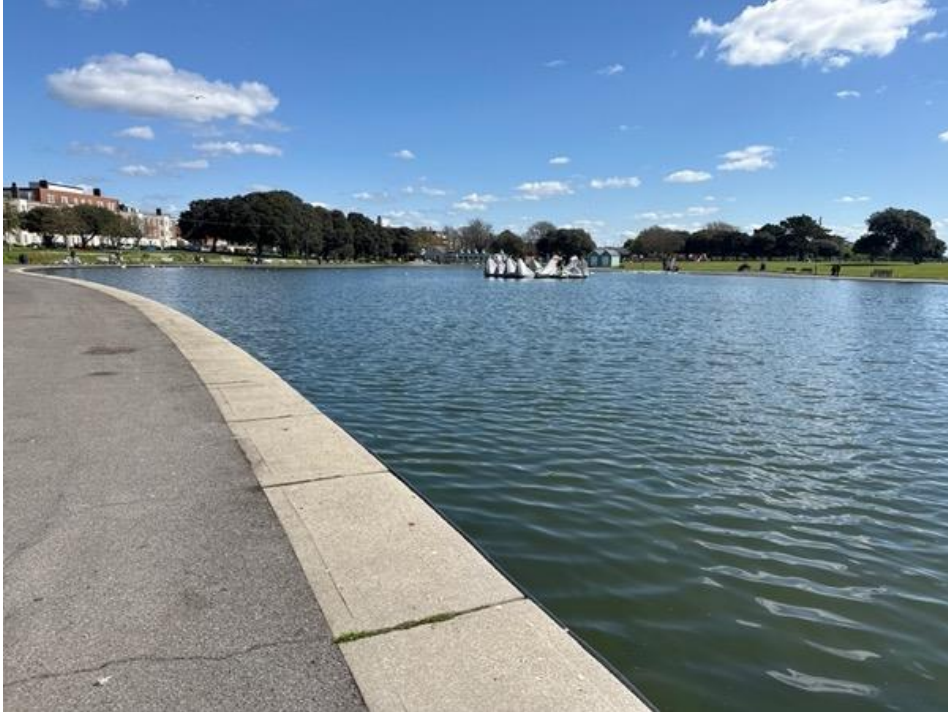
Photograph 1 : Canoe Lake with Good Edge Protection

Remove the 5 PRE life rings. Continually monitor for changes to the environment with at least logged quarterly visits.