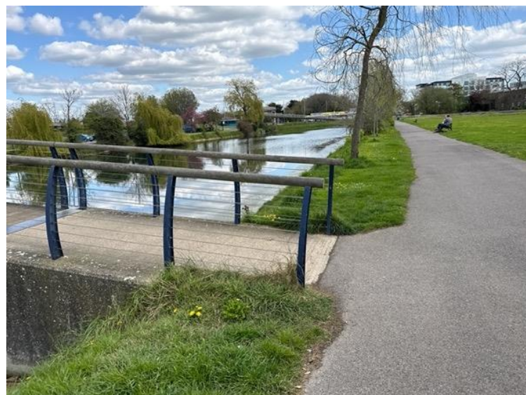
Photograph 2 : Bridge Across Waterbody