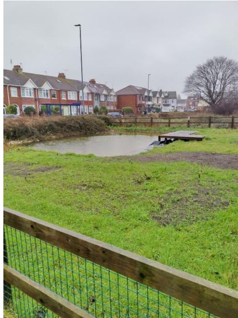
Photograph 1 - Baffins Dipping Pond

No changes required. Continue to monitor site for significant changes via quarterly visits