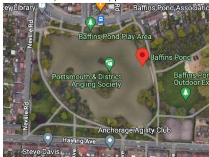
Map of Baffins Pond

Baffins Pond is a shallow water body in a community park.