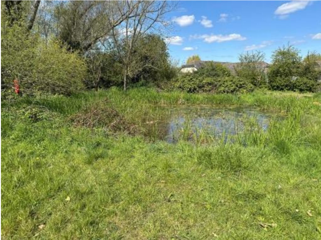
Photograph 1 : Shallow Pond with Natural Edge Protection and PRE

Remove PRE life buoy and do not replace. Continually monitor for changes to the environment with at least quarterly visits.