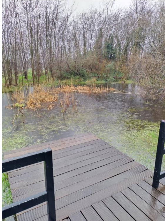
Photograph 1 - Tamworth Pond

No changes required. Continue to monitor site for significant changes via quarterly visits.