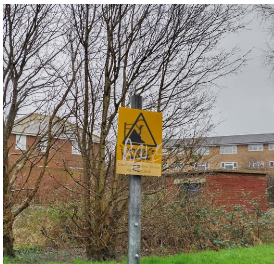
Photograph 2 - Danger of Ice sign